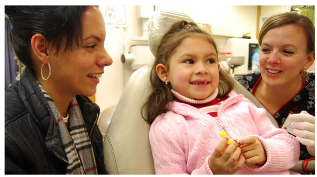
PRASAD Children's Dental Program Inc.