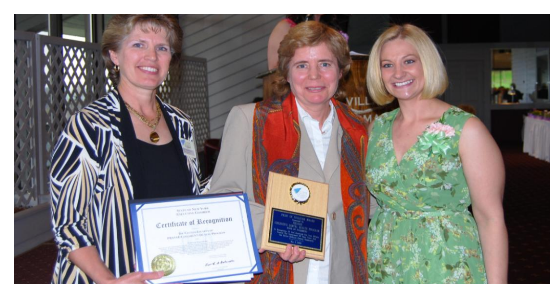
Highlights of 2009