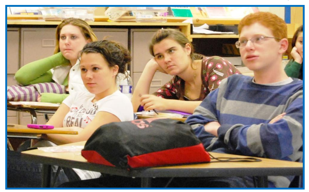
Highlights of 2008